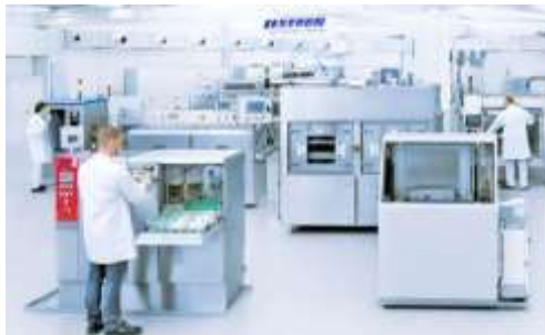
Machine Test Center