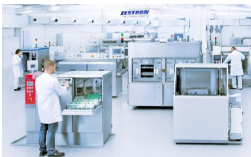
Machine Test Center