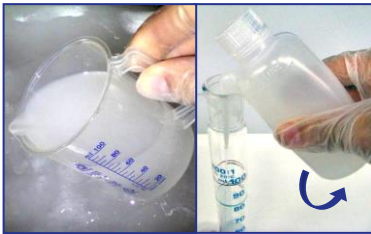
1) Sampling / Decanting