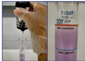
2) Adding test solution