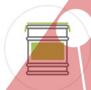
35 Kg DRUM