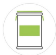
255 Kg DRUM