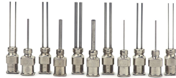
Custom lengths and diameters are available upon request.

This range of tips can be sterilized by an autoclave process for applications requiring sterile equipment.