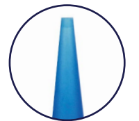
Standard Single Tapered UV Blocking