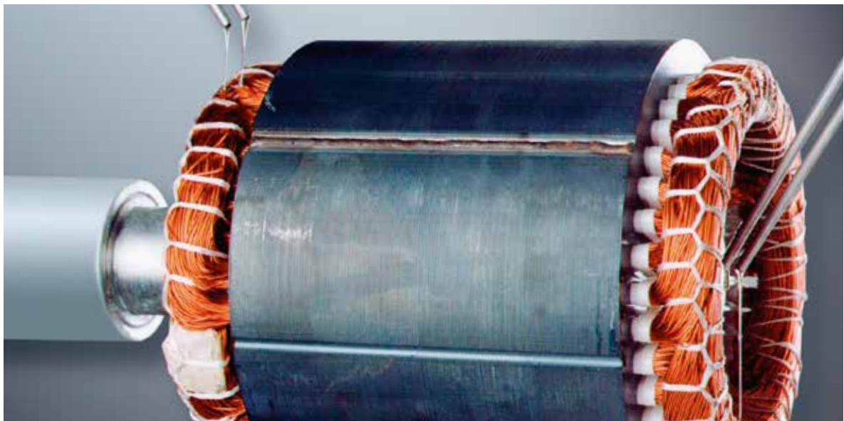
Process of trickling the resin over a stator.