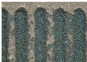
IPA related paste collapse

Using IPA in screen printers can cause defects! Chemistry effect on solder paste printed on copper substrate wet with cleaning agent